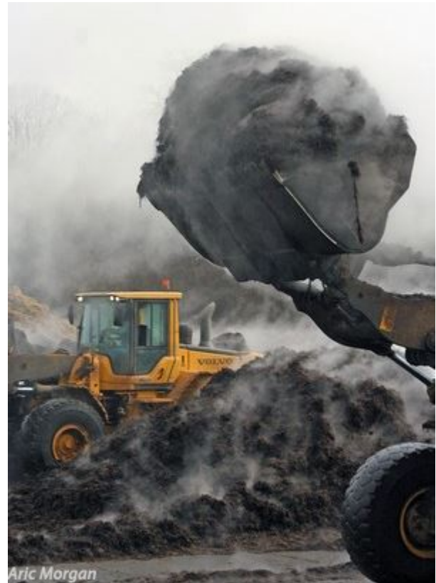
Figure 2. Bucket loaders mix and turn compost in volume. Bulk density is used to convert compost weight ratios to volume ratios for efficient handling.

The mixing ratio is 2.34 \div 0.66 = 3.5 or, 1 bucket manure mixed with 3.5 buckets of rice hulls. Since a whole number ratio is desired, a decision must be made to round the ratio up to 1:4 or down to 1:3. Since the moisture content of a 1:3.5 manure:rice hull mixture is 53% according to Method 1 in section 25.3, we can round up or down without throwing the moisture content outside the 50-60% preferred range. In this case, rice hulls represent an off-farm input. To reduce cost, a decision is made to round down to 1:3 ratio. In fact, a 1:2 ratio could also be considered while maintaining acceptable moisture content and C:N ratio (the reader may do the calculations). Here a 1:3 ratio is preferred since the farmer would like the flexibility of adding irregular quantities of cow manure, fresh weeds, etc. without hindering the process.