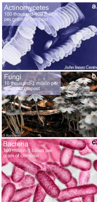
Figure 1. Every cubic inch of compost teems with microorganisms busily transforming organic waste. Actinomycetes (a) are filamentous bacteria that emit volatile geosmins during their metabolism, imparting the earthy, humic aroma of freshly turned topsoil. Telltale fruiting bodies of fungi (b) bespeak nature's irresistible yin-yang polarity. The business end of fungi are their microscopic thread-like mycelium that excrete digestive enzymes. Bacteria (c) play a key role in organic matter decomposition and nutrient cycling in the biosphere, of which compost is a microcosm. Quantities of microorganisms are from Sterritt (1988).

hemicellulose, sugars, and starches, collectively known as carbohydrates that are composed of the elements carbon, oxygen, and hydrogen. Cellulose is the most abundant carbohydrate present in plants and organic matter. Lignin is a carbon-rich polymer present in mature plant tissues, and accounts for approximately 10% to 30% of the dry matter of mature plants. Lignin imparts strength to the vascular tissue of plants and, together with cellulose and hemicellulose, accounts for 90% to 95% of the dry matter of mature plants. In short, there is a surplus of carbon in plant and animal tissue, whereas nitrogen is relatively scarce. The C:N ratio in most fresh tissue varies because of differences in nitrogen content , not carbon.